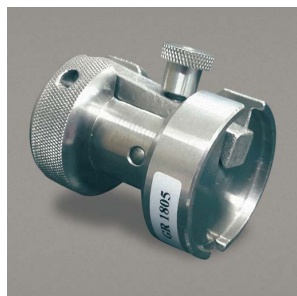
Mechanical Type Sample Holder