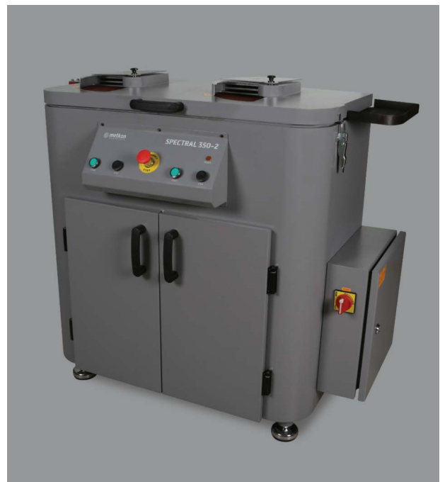
SPECTRAL 350-2 Double Disc Surface Grinder