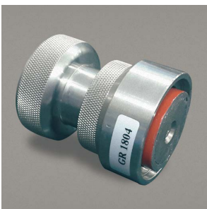
Magnetic Type Sample Holder

Magnetic and mechanical specimen holders for samples up to 50 mm. dia. available ensure maximum operator safety.