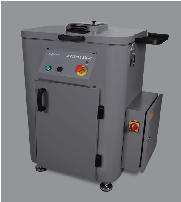
SPECTRAL 350-1 Single Disc Grinder

SPECTRAL 350 is used to achieve excellent precision flat surfaces of iron and steel samples for spectroscopic analysis. The robust and vibration-free construction has been designed for continuous operation at high sample throughput.