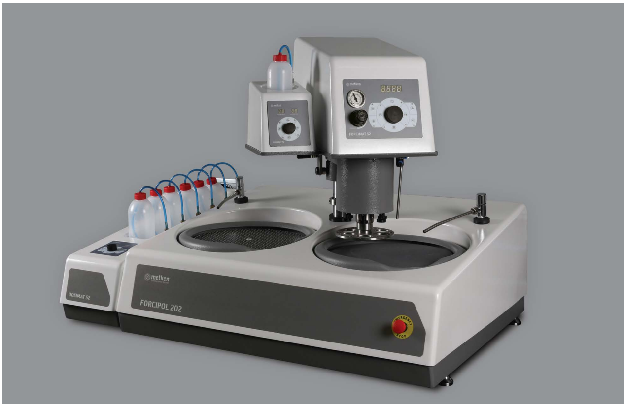
FORCIPOL 202 + FORCIMAT 52 + DOSIMAT 12 + DOSIMAT 52

Dispensing parameters like; frequency, dosing time, fluid selection etc. are controlled through the LCD screen of the FORCIMAT 102 Automatic Head and can be stored in memory.