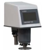
FORCIPOL CONTROL UNIT