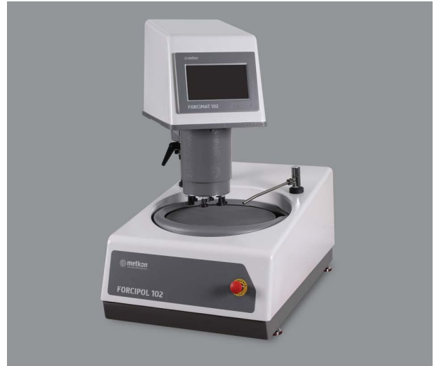
FORCIPOL 102 with FORCIMAT 102

The "soft start and stop" feature automatically starts the sequence with a low initial force which is then increased to the preset. Towards the end of the cycle, the force is automatically reduced to 75 % of the setting to prevent scratching. A variety of sample holders for individual or central force applications are available for different sample sizes. Both individual and central force specimen holders can be removed and inserted easily with the help of quick release chuck. By holding the head button on the software, the specimen holder will rotate for easy insertion and removal of the specimens.